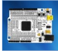
FEZ Panda Board

The .NET Micro Framework is an implementation of .NET for devices that are resource constrained. In this session, we'll explore some of the technical details behind the .NET Micro Framework, take a look at some .NET Micro Framework devices, and get some hands on with some affordable devices that you can use right away. We'll show you how any .NET developer can learn to program embedded devices. We'll also talk a little bit about "The Internet of Things" and how you can get started experimenting with connected devices. We'll even have some devices on-hand for you to try out!